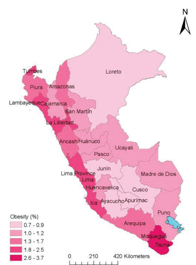
Figure 1. Prevalence of obesity in children under 5 years of age in Peru during the year 2017 in English that use in some way GIS (14). In this paper, the current state of obesity in Peru is looked into by presenting the spatial distribution of the prevalence of obesity across the country for the year 2017.