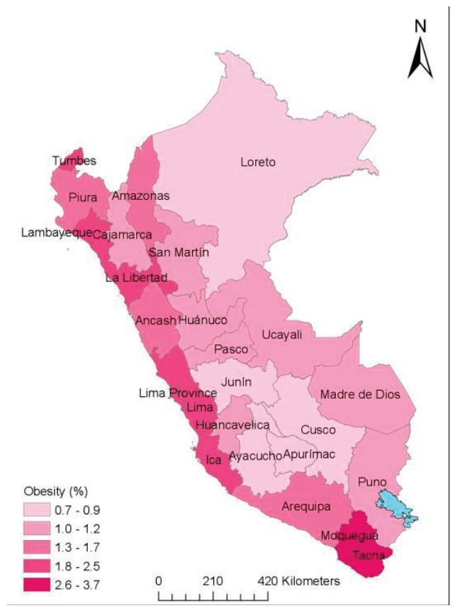
Figure 1. Prevalence of obesity in children under 5 years of age in Peru during the year 2017

in English that use in some way GIS (14). In this paper, the current state of obesity in Peru is looked into by presenting the spatial distribution of the prevalence of obesity across the country for the year 2017.